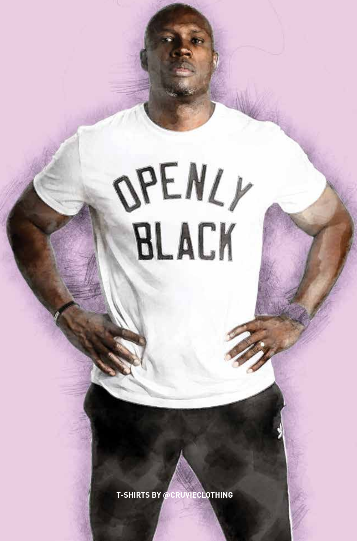
T-SHIRTS BY @CRUVIECLOTHING