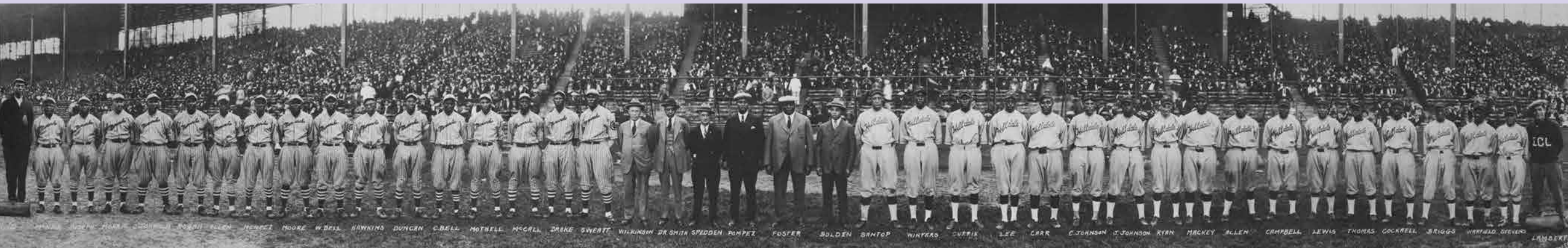
First Black World Series, Kansa City, Missouri (1924)

The Negro Leagues introduced baseball to Japan and Latin America. And Jackie Robinson, by becoming the first African American player to integrate the Major Leagues in the modern era, saved the all-white Major Leagues as well as America.